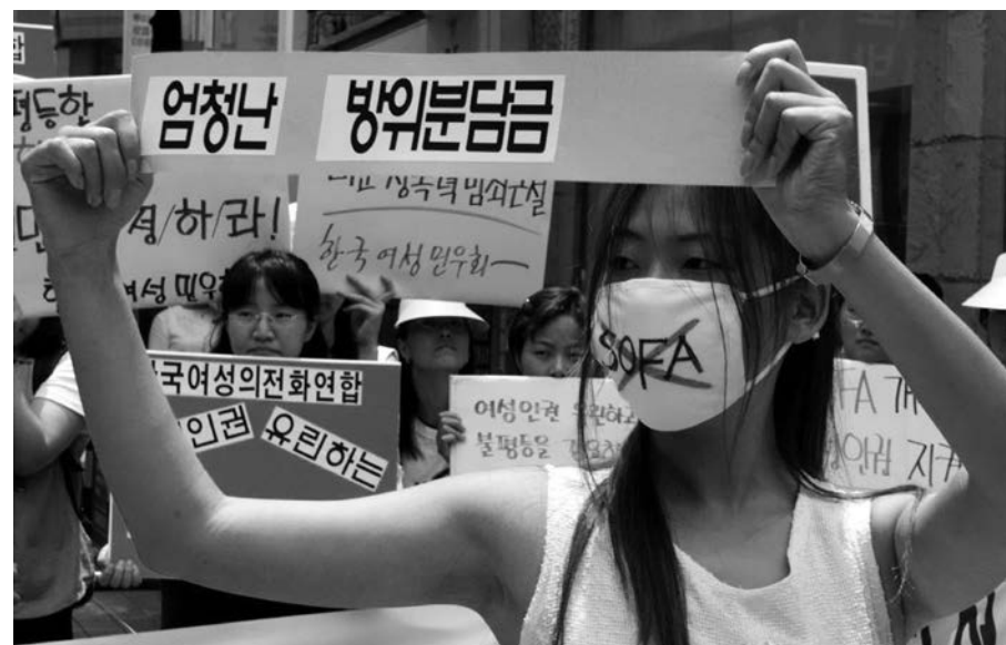
▲ A masked South Korean protester performs during an anti-U.S. rally downtown of Seoul July 27, 2000. The protesters demanded a revision on the SOFA (Status of Forces Agreement) saying the agreement allow excessive privileges to U.S Forces in Korea (USFK). Tensions between Korean citizens and the U.S. military have been rising since USFK dumped 20 gallons of formaldehyde into Seoul's main river in February 2000. The poster reads “Huge share of military expenses” in relation to the millions of dollars paid by the South Korean government for the maintenance and operation of the USFK annually.

This highlights the urgent need for a stronger regulatory approach to the resolution of TRW. The power dynamics of international relations should not dictate whether or not lives are put at risk from military pollution.