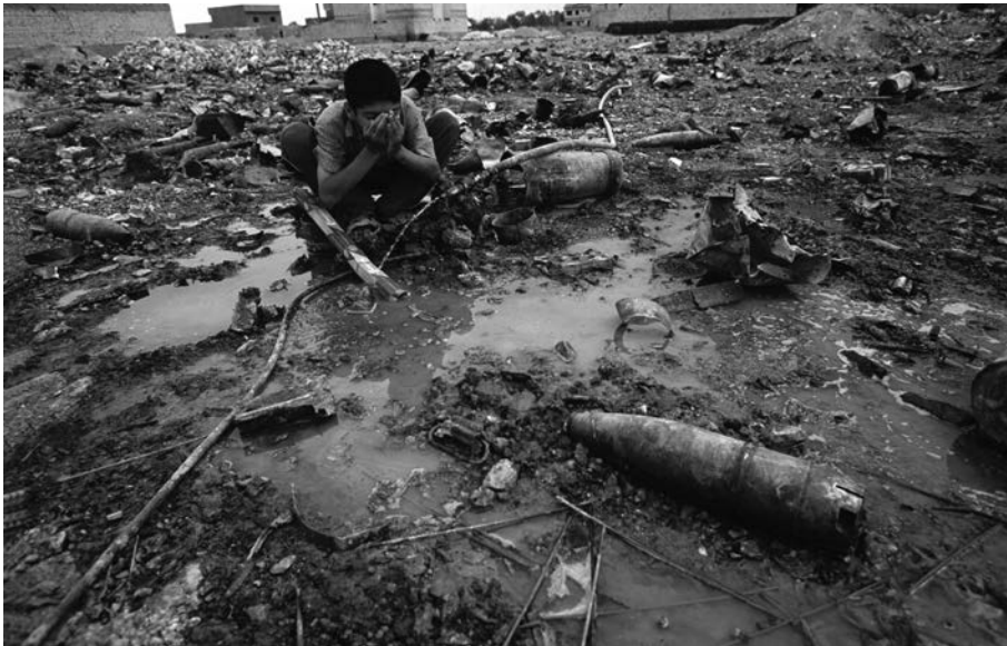
▲ ————— War debris litters the Iraqi landscape. Sung Nam Hung Circa post 2003