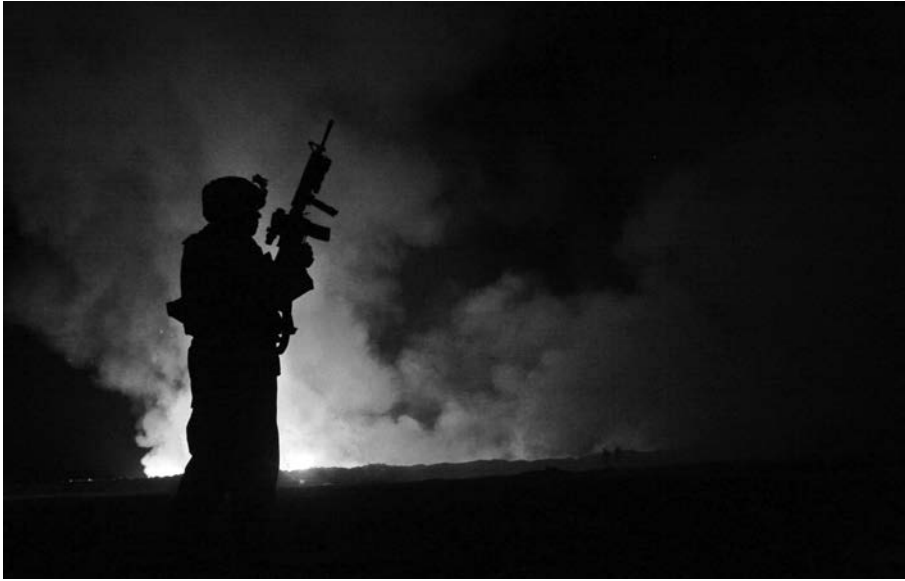
▲ Regimental Combat Team 6, watches over the civilian firefighters at the burn pit as smoke and flames rise into the night sky behind him in Camp Fallujah, Iraq. 01.06.2007