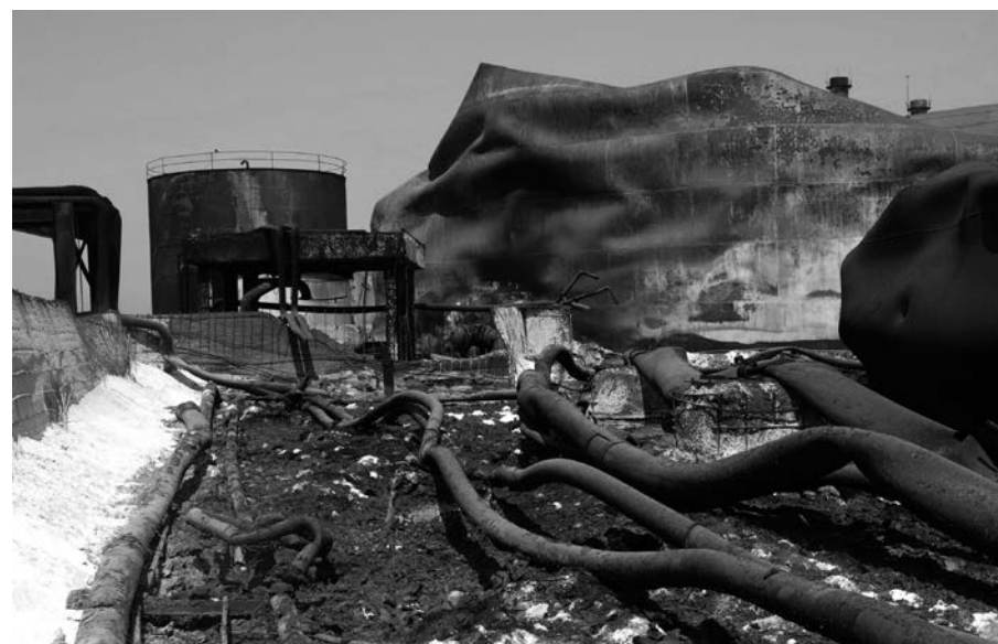
▲ Devastation around the destroyed tanks of the Jiyeh power station, Lebanon.