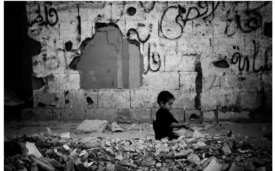
▶ ————— A young boy plays in the rubble of his neighborhood in Khan Yunis, Gaza Strip Occupied Palestinian Territory. 13.05.2006