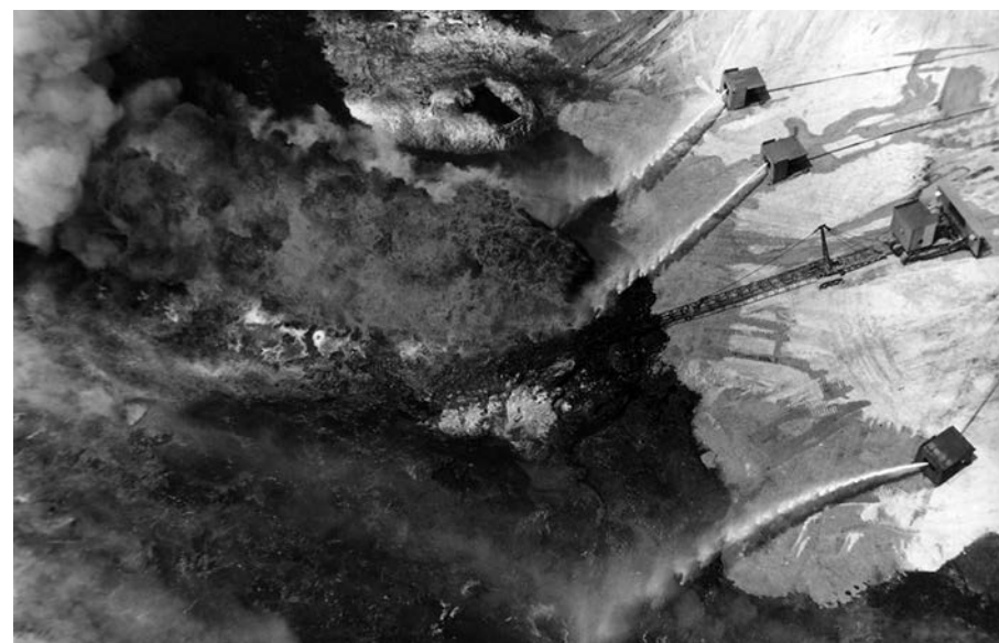
▲ Water cannons used to extinguish oil fires in Kuwait. Kuwait Oil Company Circa 1991

Cases in which individuals have been held responsible for environmental war crimes are also lacking. This issue will be further explored in section 6.1.