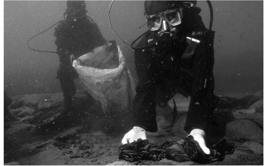
▶ Divers survey damaged caused by an oil spill resulting from the aerial bombardment of Jiyeh power station, Lebanon, in July 2006. The spill has caused damage to endangered species and fragile coastal ecosystems. 19.09.2006