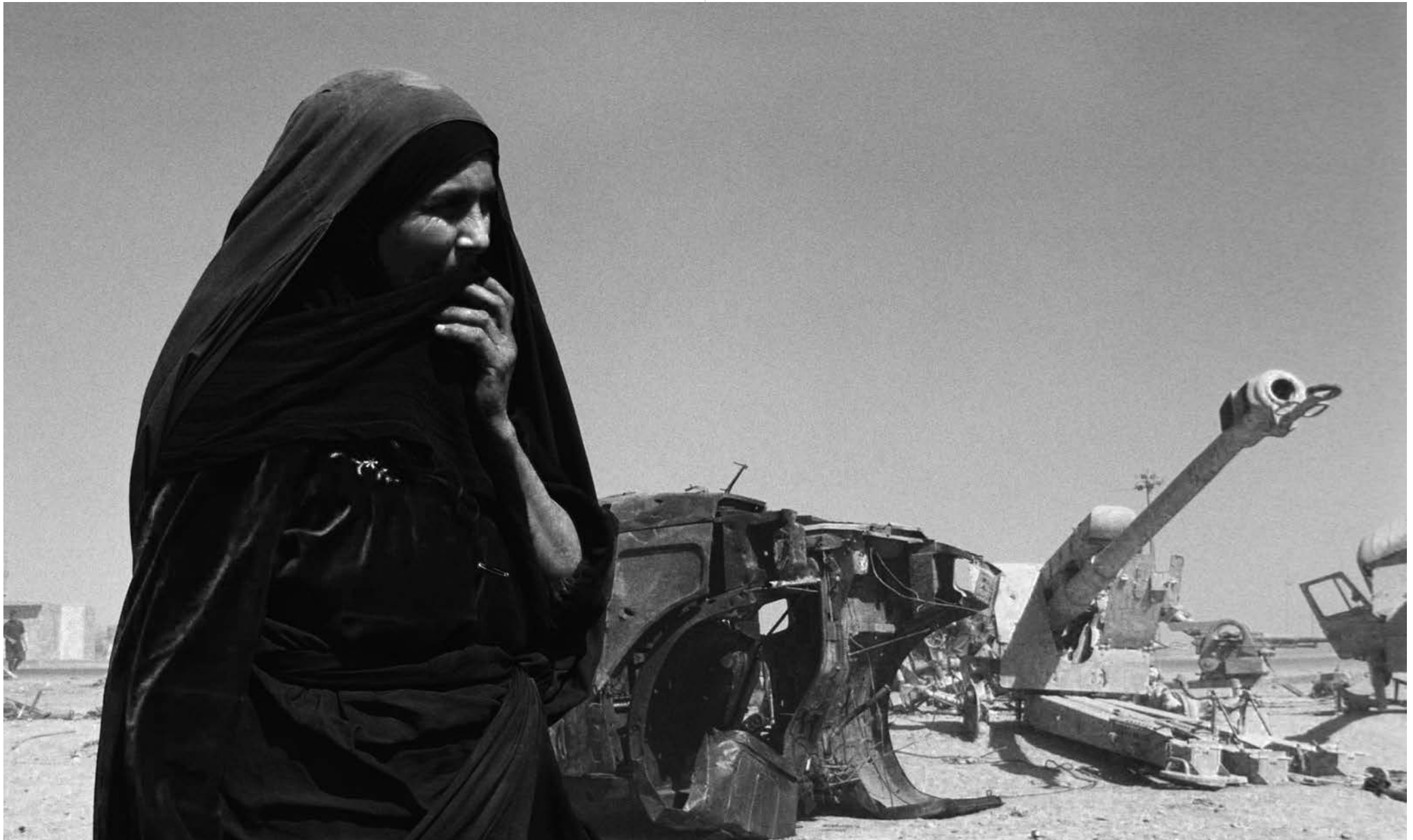
▲ Woman in front of discarded military scrap metal in Iraq. People living among this debris are at risk of exposure to toxic military waste.